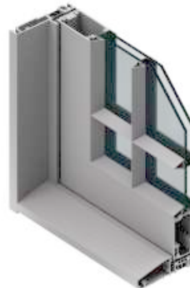
Series 7900s Hinged Right - Swing In Door

Actual values may vary depending on product specifications and configuration. *Glass Makeup = 1" OA E366/Argon/Clear