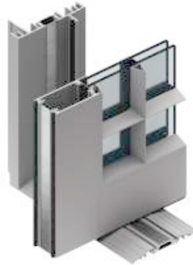
Series 7980s Pivot Door - Open

Actual values may vary depending on product specifications and configuration. *Glass Makeup = 1" OA E366/Argon/Clear