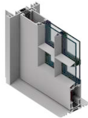
Series 7980s Pivot Door - Closed